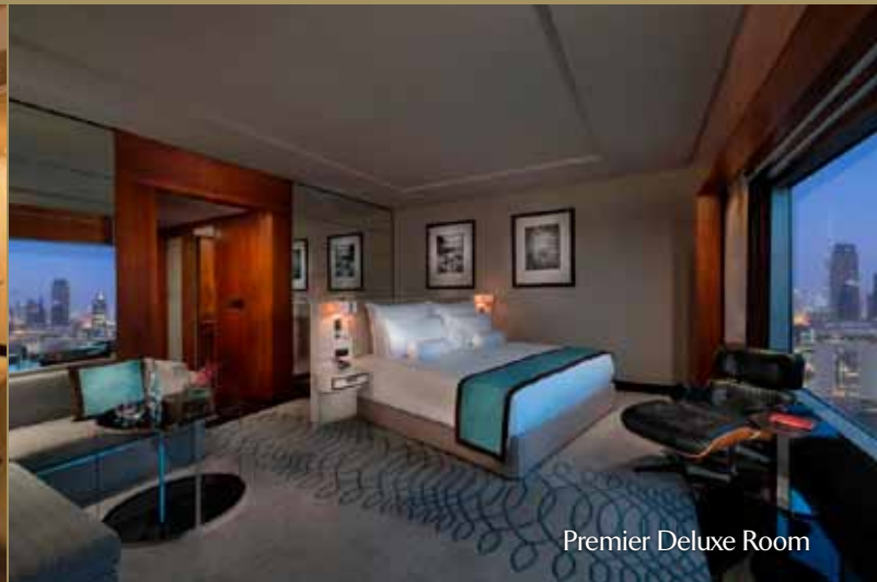
Premier Deluxe Room

Location | Occupying pride of place in the Emirate, alongside Sheikh Zayed Road, the hotel is just a few minutes walk from major business districts and the Dubai Metro. Dubai International Airport is about 20 minutes away while the drive to Abu Dhabi International Airport takes approximately one hour and 15 minutes.